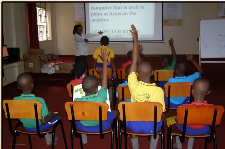
An active Class ; Learners Respond to Questions on ICT Developement in Uganda .