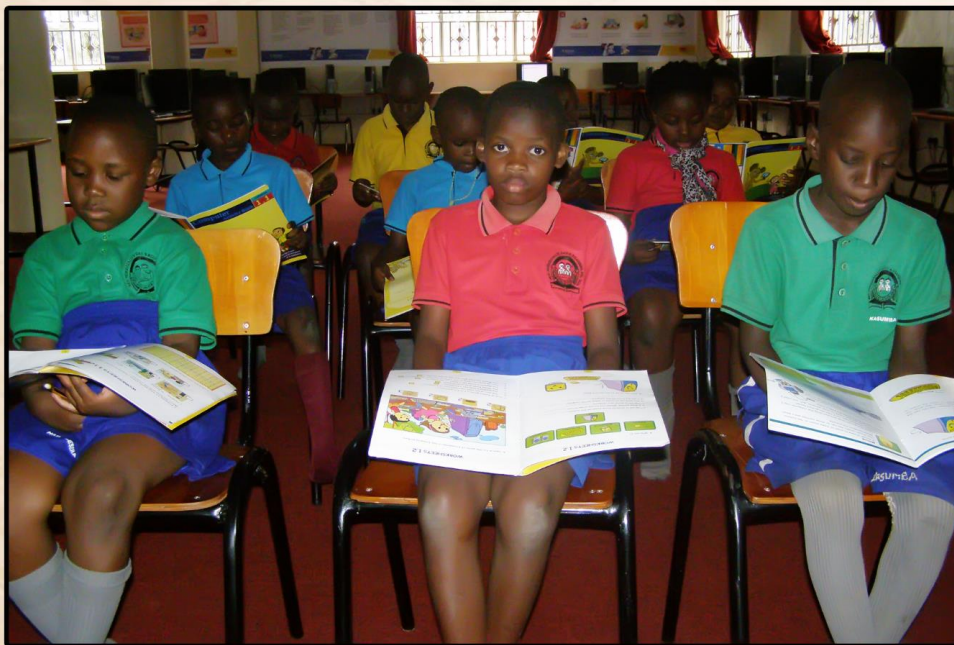
Learners take time to Review information, Education and communication (IEC) Material