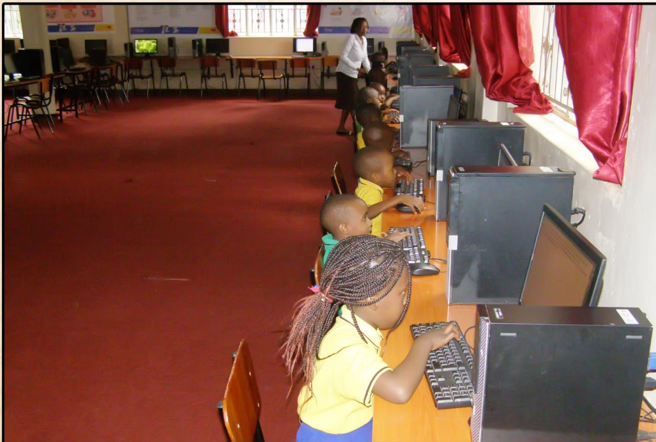
A section of Learners from Top Class