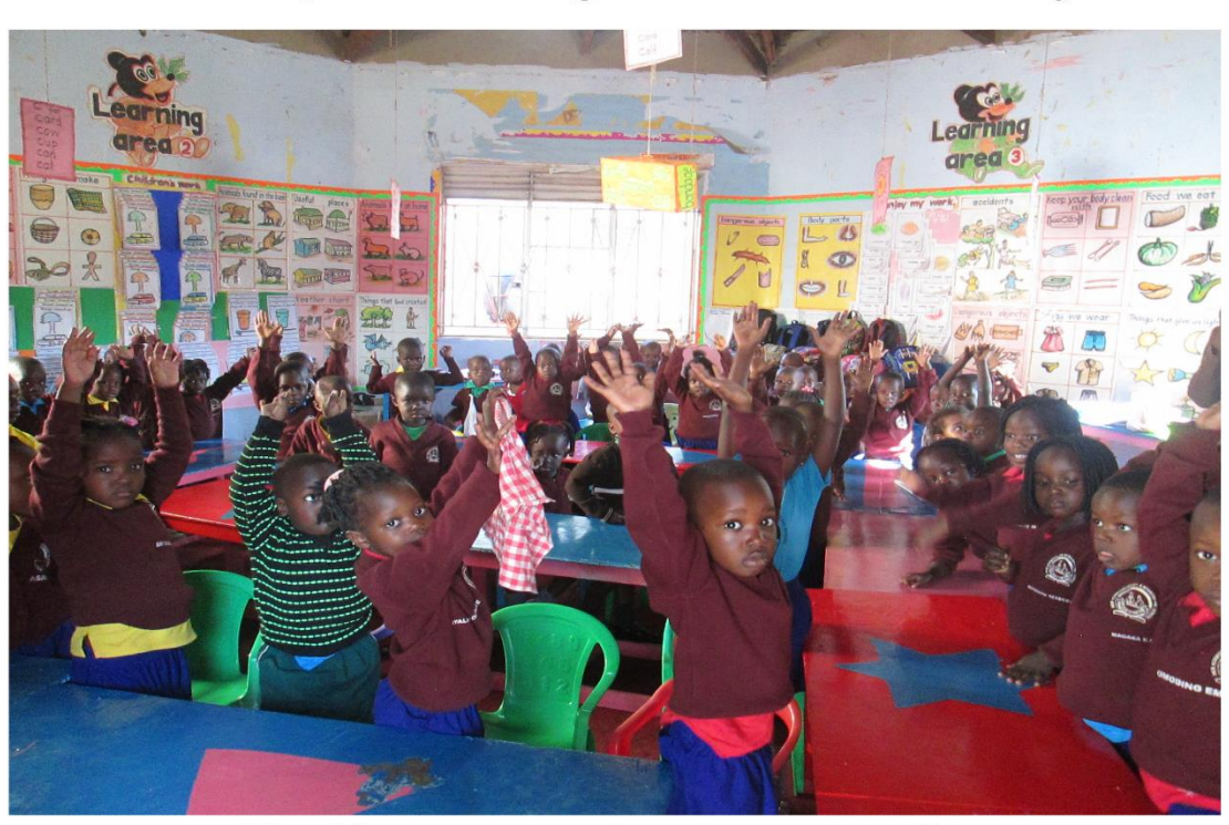
The Nursery section is very active