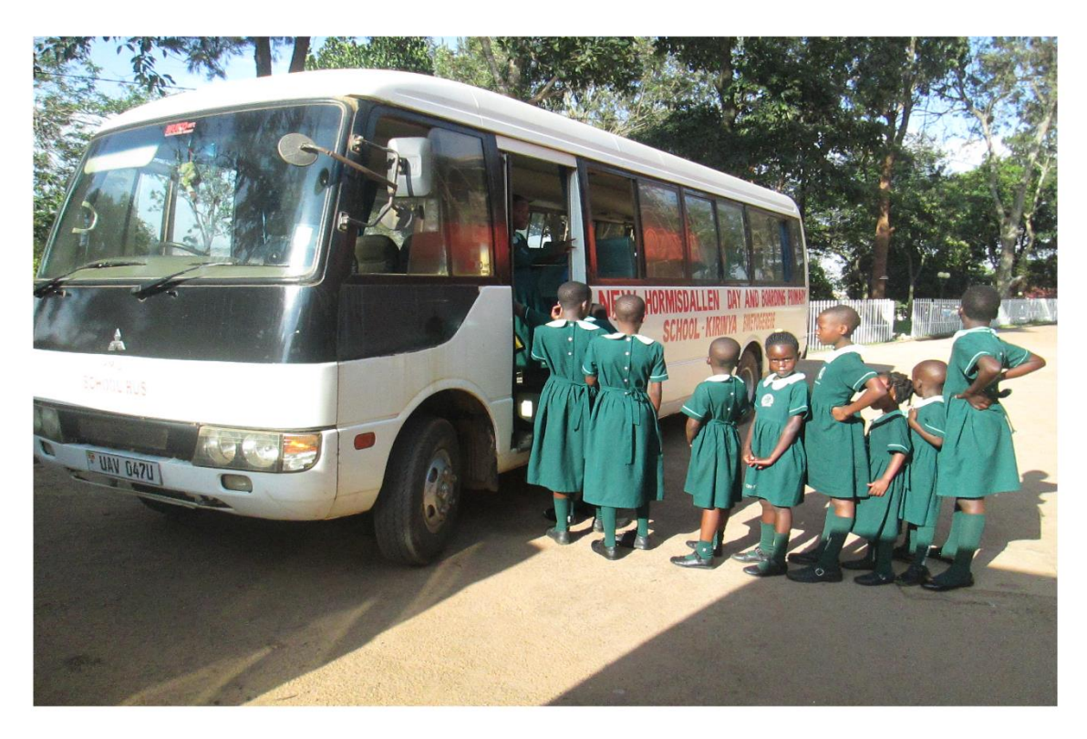
The School has pick and drop services