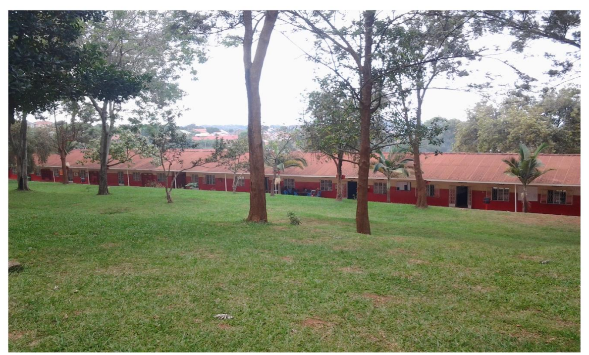
Aerial view of Nalubowa Garden and Lower classroom blocks