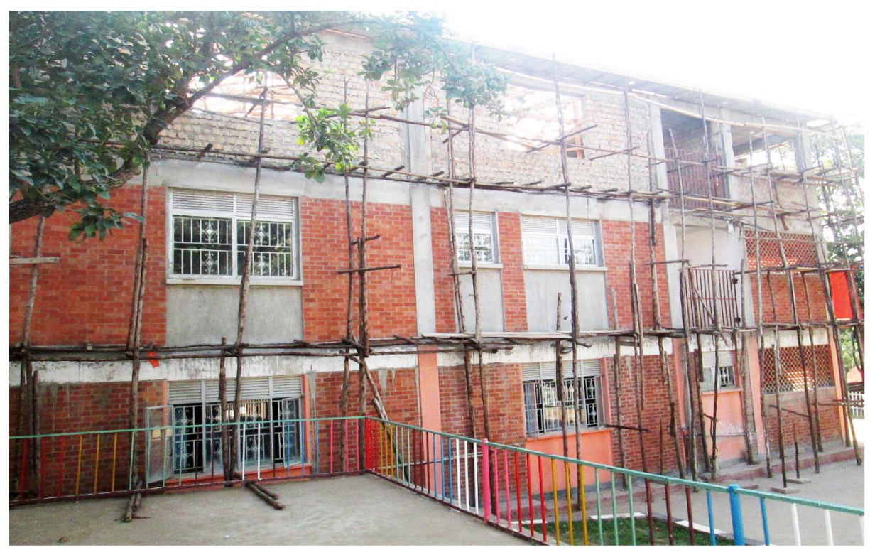
Side view of the multi-purpose complex under construction