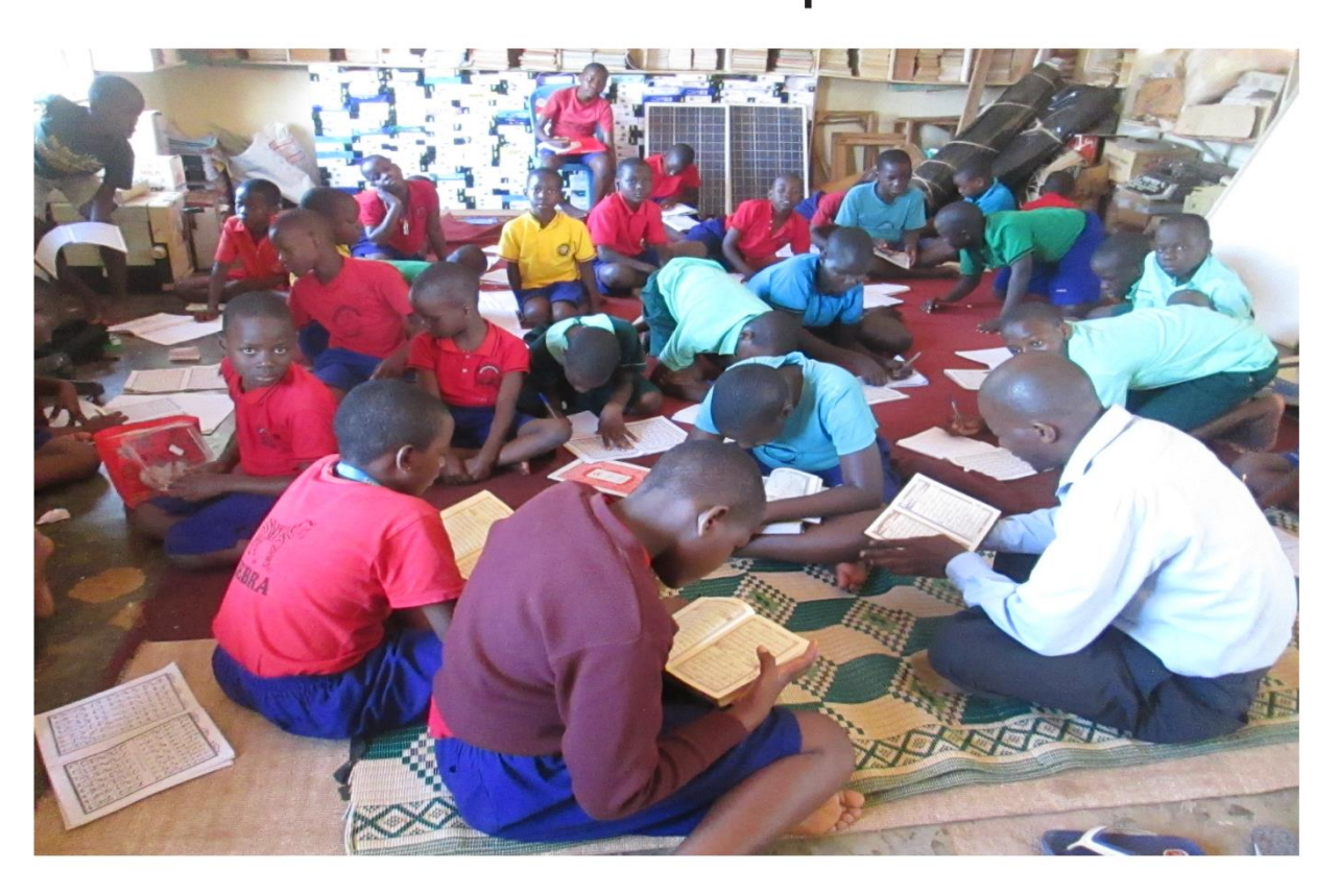
Freedom of worship. Here learners attend Islam teaching