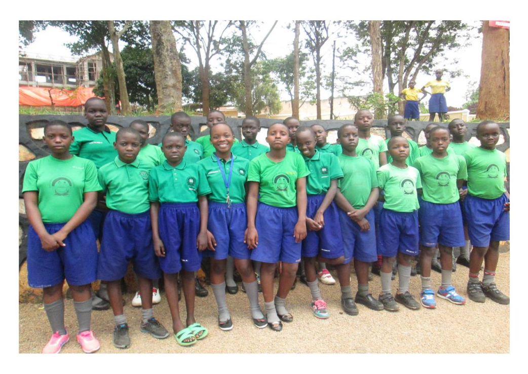
A section of candidate's class 2018.