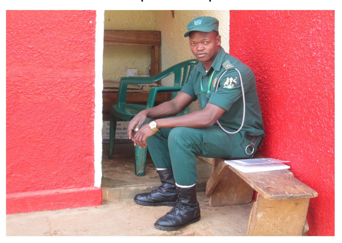
Smartness is part of security requirement