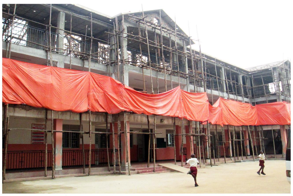
Front view of the multi-purpose complex under construction