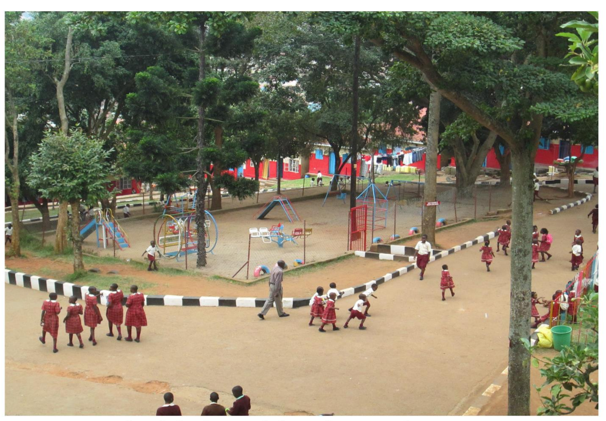
Aerial view of the play station