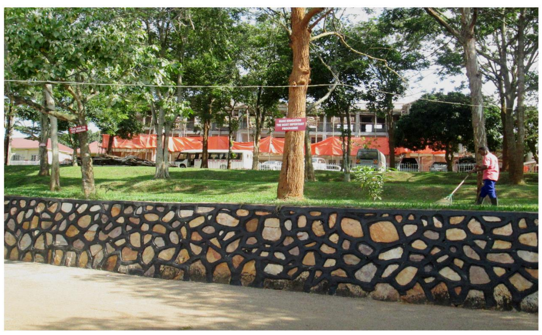
All compounds designed to enhance safety