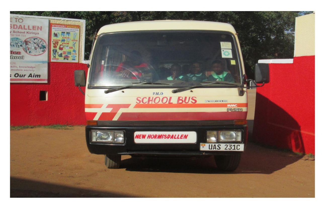
Main access to the school premises