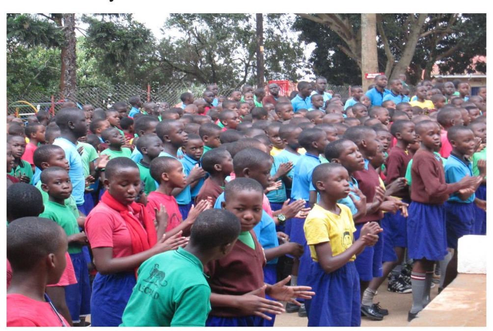
A section of school community photographed during assembly on 02/10/2018