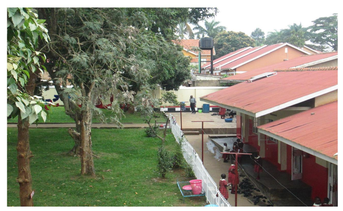
The School has affluent neighbourhood