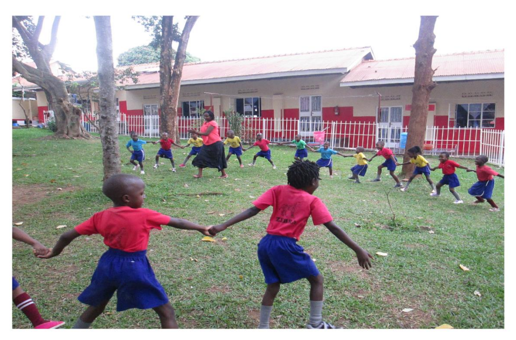
Physical Education is continuous