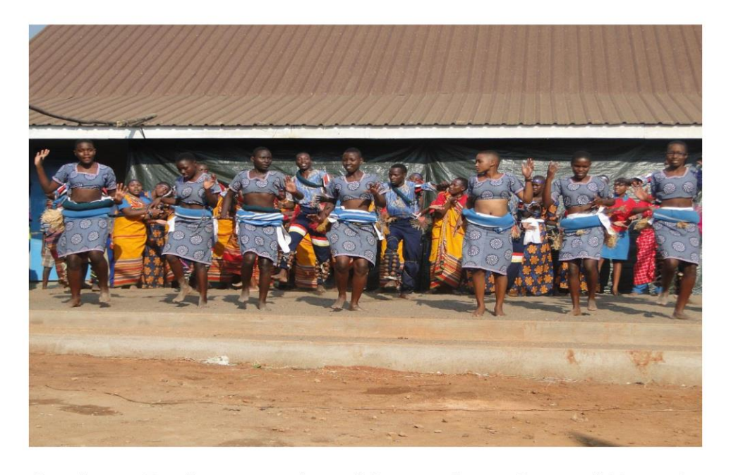
Students Perform a cultural Dance from Central Uganda