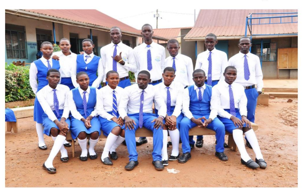
A Section of Advanced Level Students Photographed in 2018