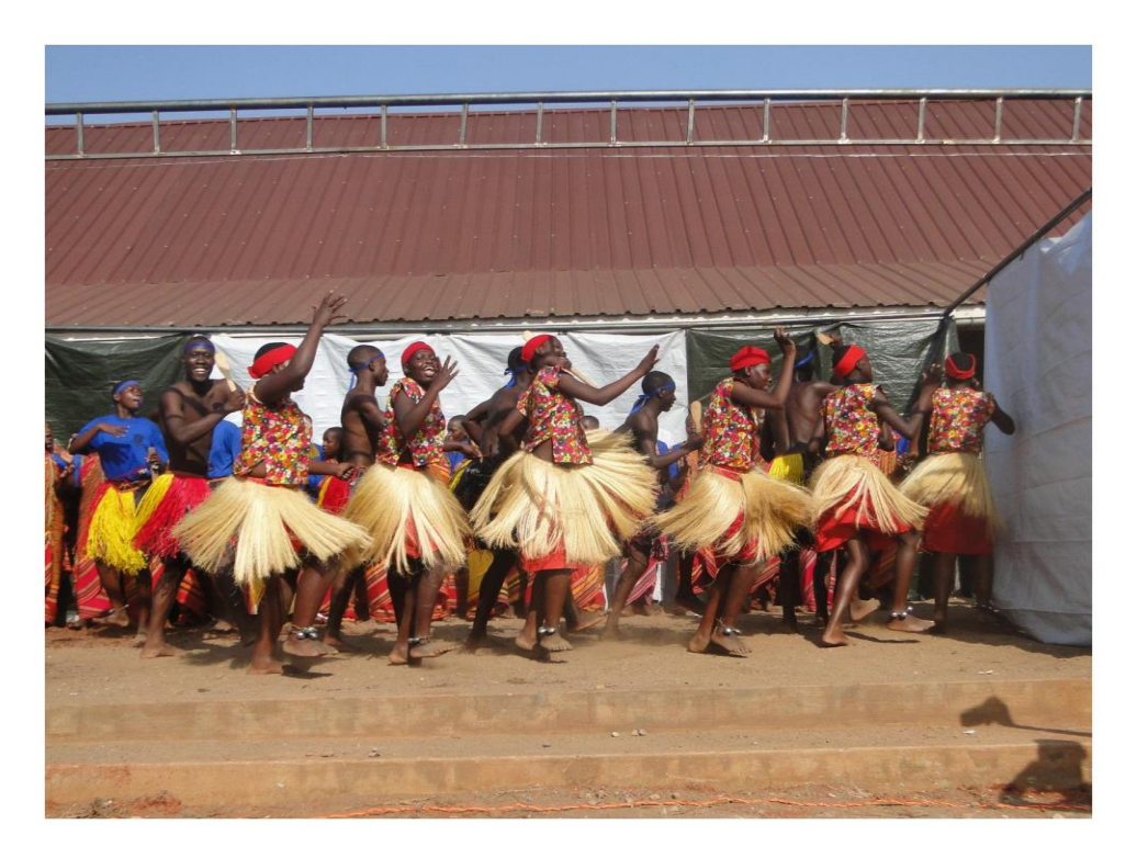
Music Dance & Drama