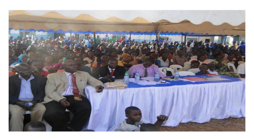
Stakeholders Watching MDD