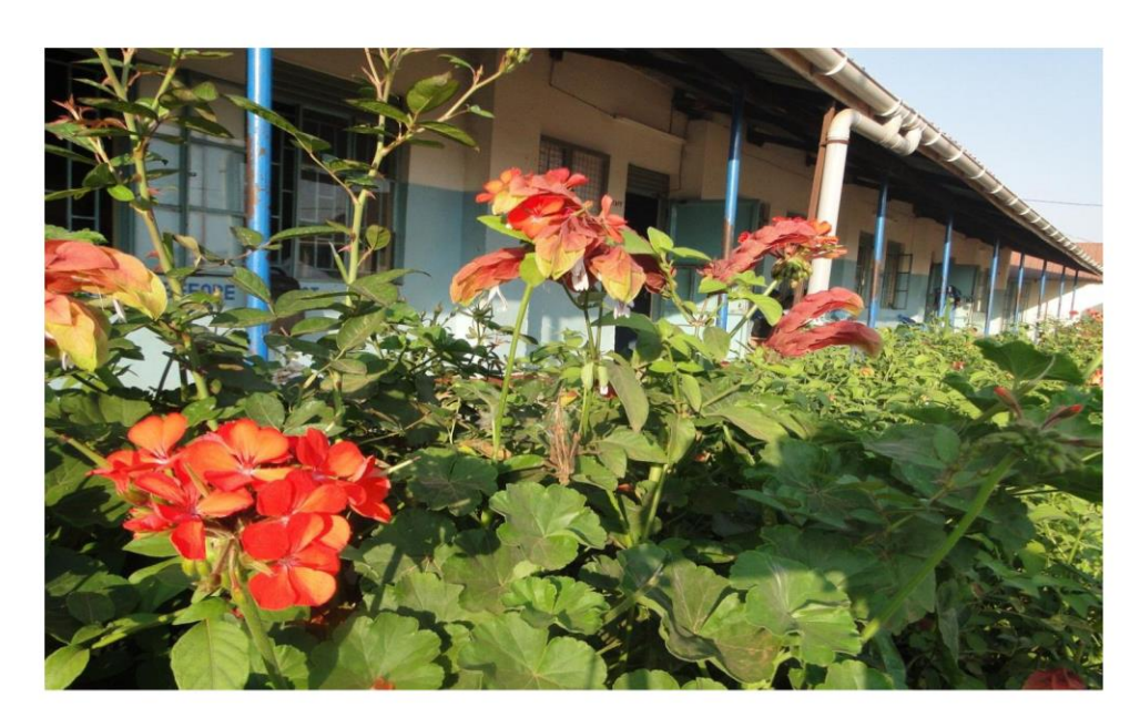
Compound Designed to Keep the School Attractive