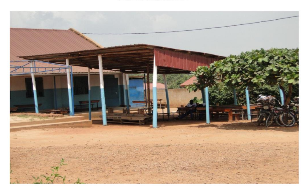
Temporary Shelter Created to Accommodate Students