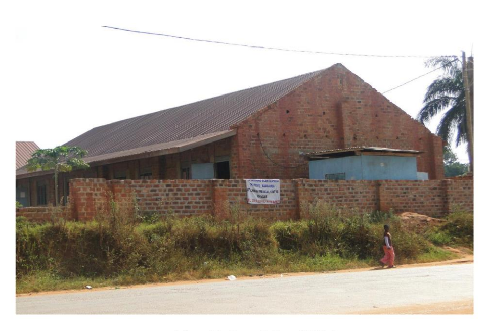
The School by 2015