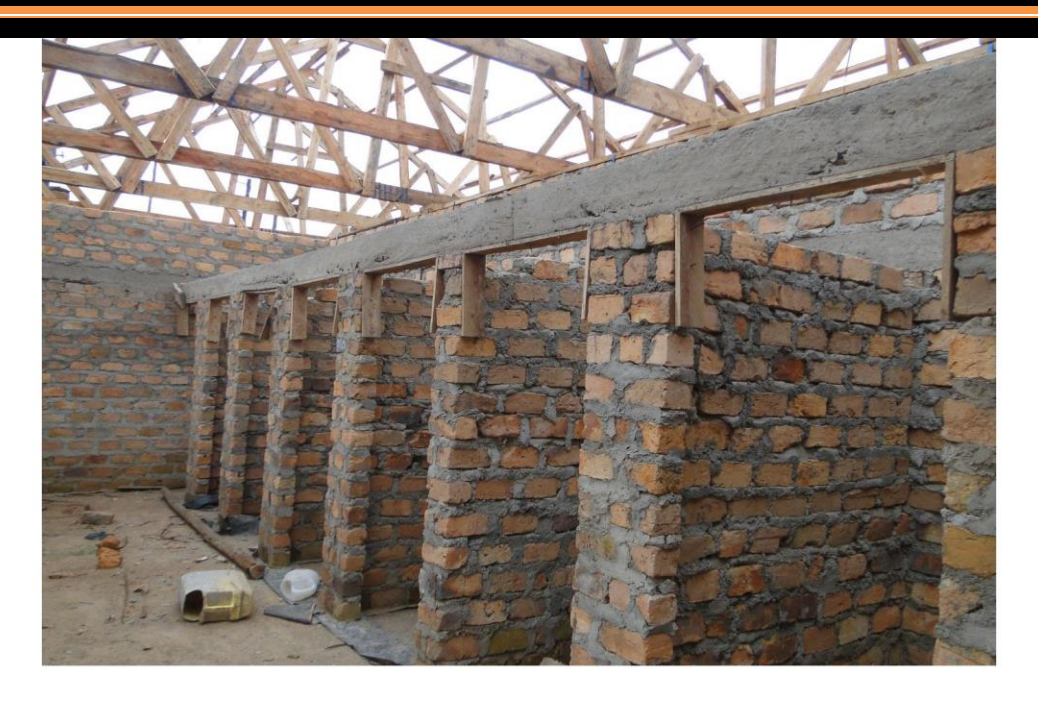
More Water-borne Toilet Facilities under Construction