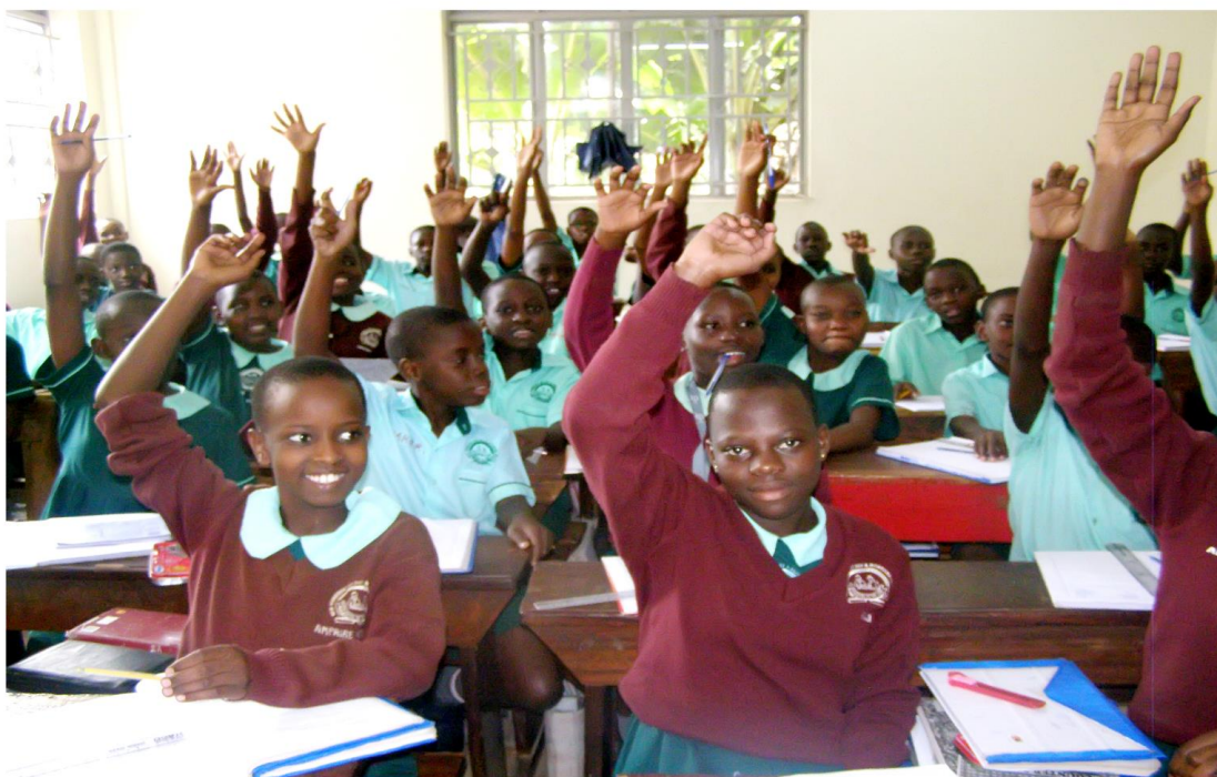
Candidate Class Primary seven 2019 respond to a question.