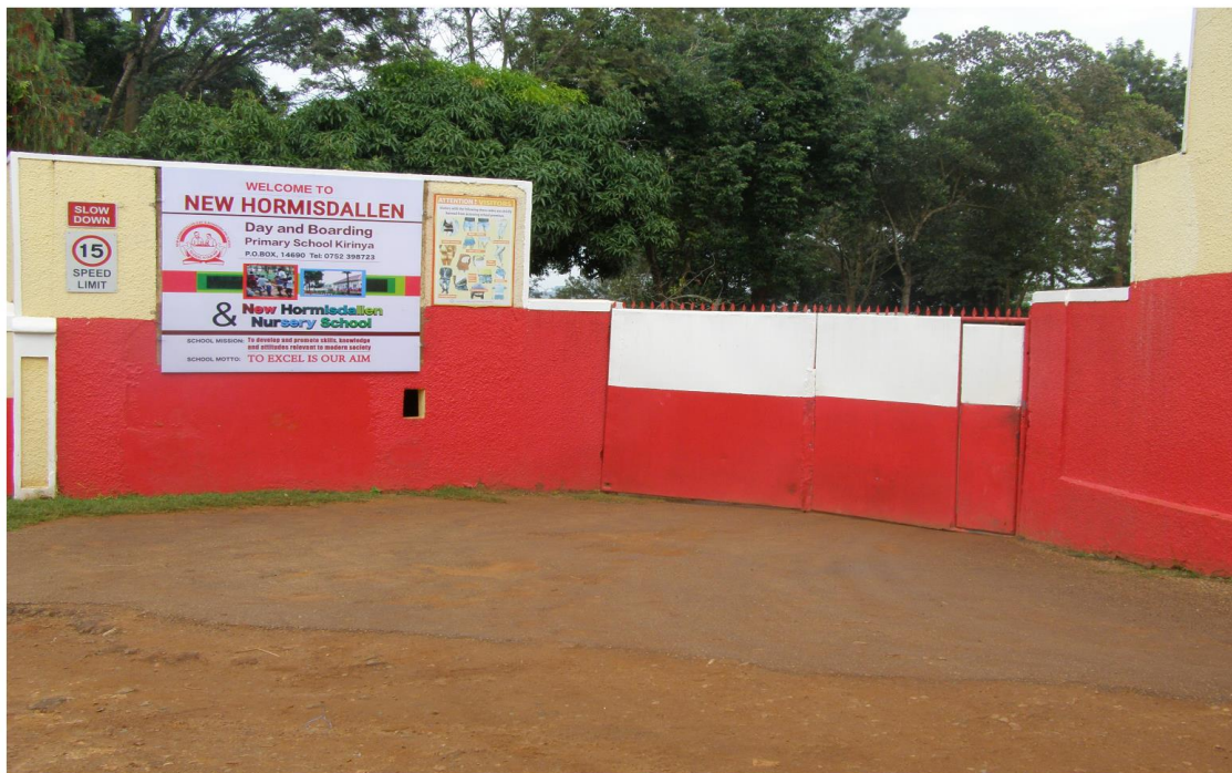
The main access to New Hormisdallen School Establishments.