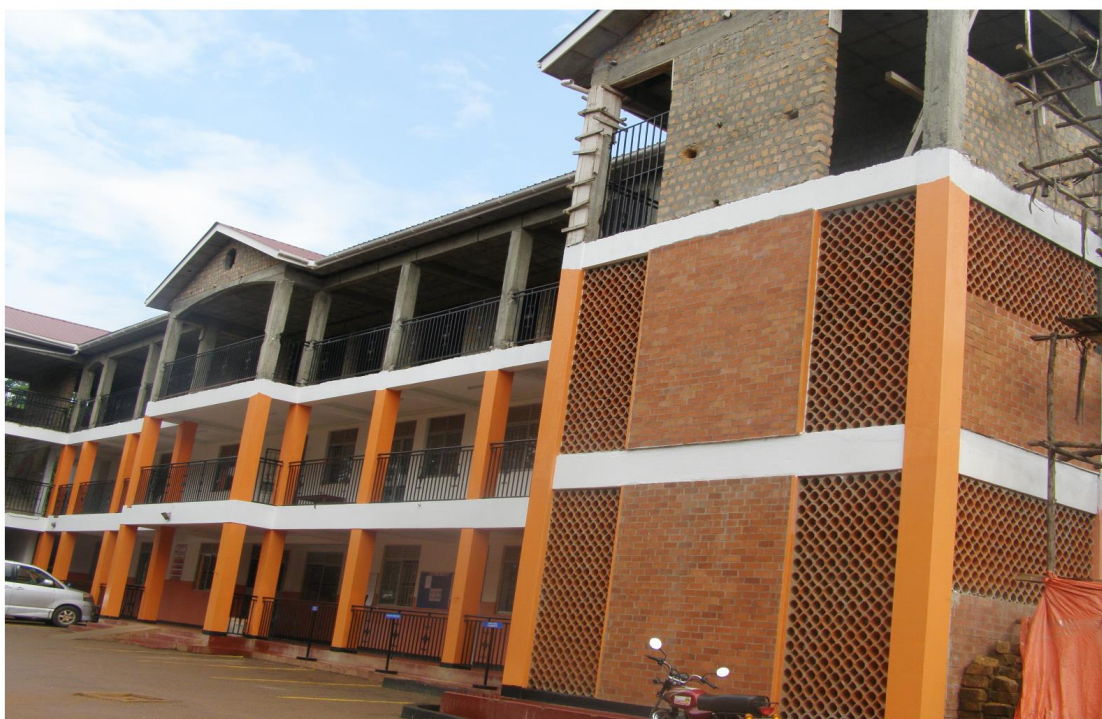
The latest face of New Hormisdallen Multipurpose Complex.