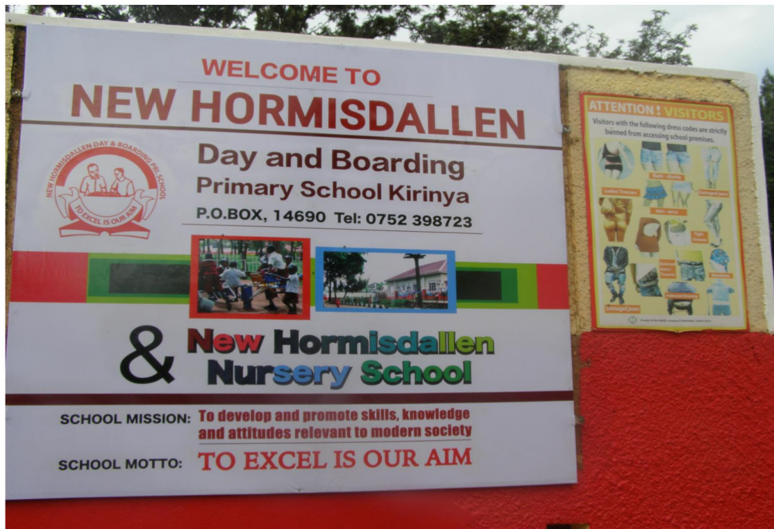
Some of the signage at the school.